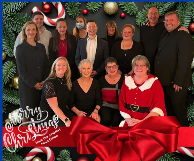
from the CPDMH Foundation Board of Directors and Foundation Team

Merry Christmas and all the best wishes for health and happiness in the New Year!